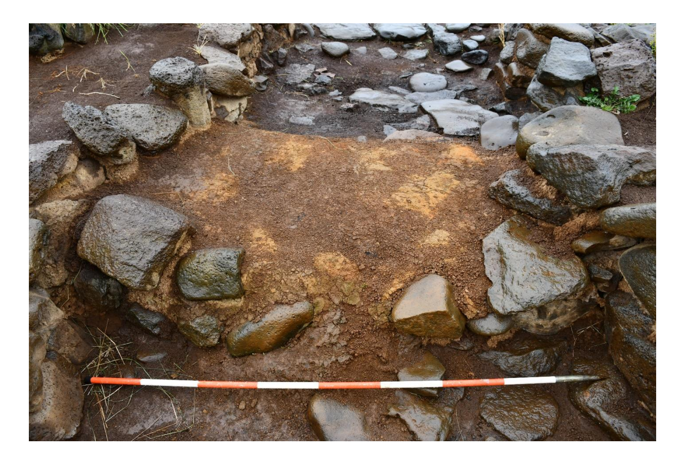
Figure 2. Wall/Veggur [93889]

All of the interior deposits of Structure E were excavated in 2018; in 2019, thin deposits of turf debris [96825] were removed from Structure G and also some patches of charcoal-rich soil [95018] over a flagstone floor which was contemporary and continuous with the floor in Structure F. A turf wall ([93889]; fig 2) which separated E and G and abutted both the eastern wall of F and eastern wall of G was removed and some of these flagstones in G were seen to continue under it and connect with disturbed flags at the southern end of E. The current interpretation is that Structures E and G formed a single, wide passage/space, later bisected by a turf wall. However it is still unclear whether this is an internal or external space.