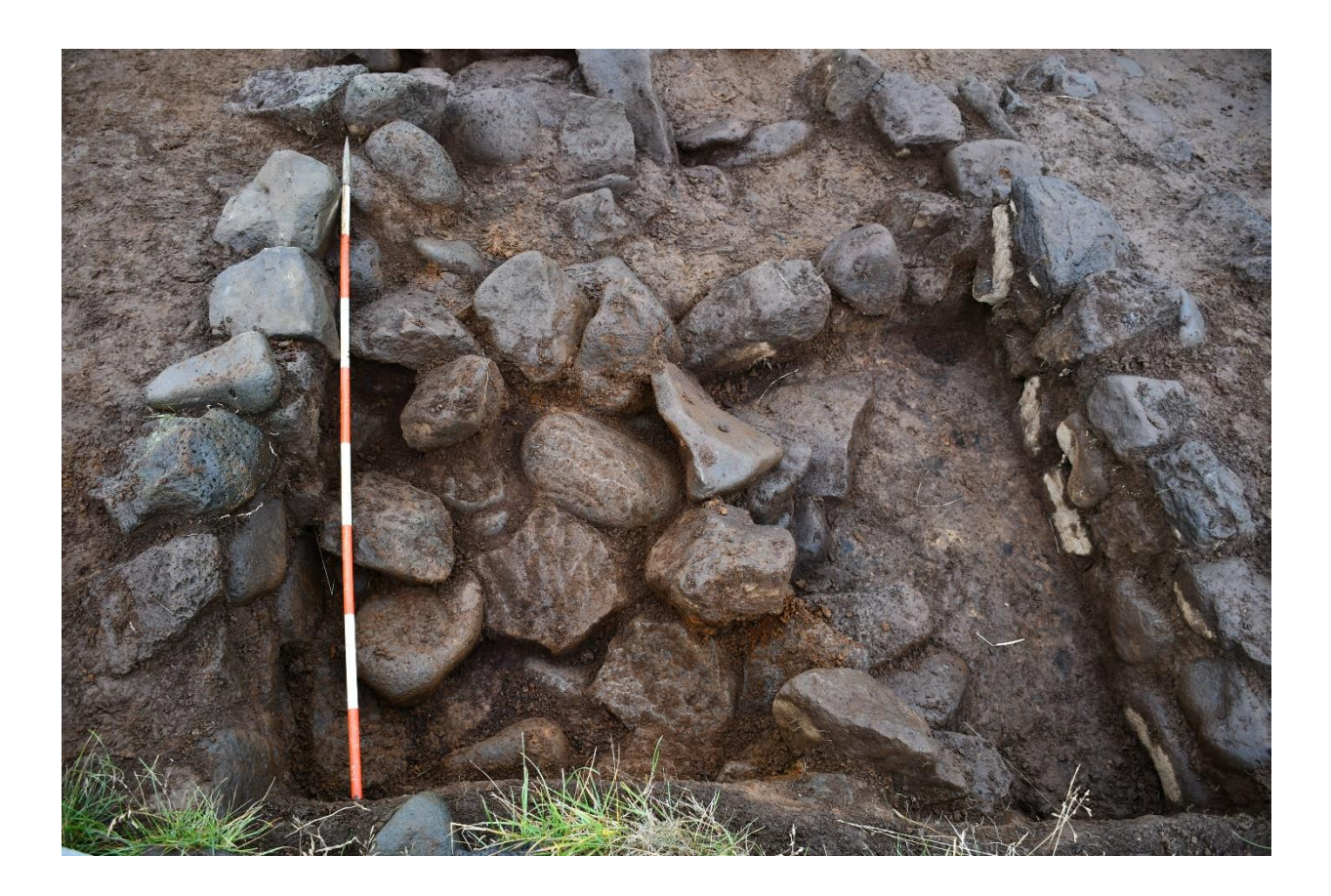
Figure 4. Detail of the interior of Structure H showing stone rubble over a possible stone floor; the postpipe is in the top right corner; facing north / Horft inn í mannvirki H þar sem sést grjóthrun yfir mögulegu hellulögðu gólfi, stoðarhola er efst í hægra horni. Myndin er tekin í norður.

probably lies under the later building Structure A to the south and will be the subject of investigation in 2020.