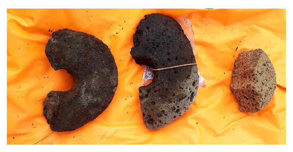
Figure 5. Three out of five fish hammers from the 2019 season / Þrjár af þeim fimm fiskisleggjum sem fundust við uppgröftinn 2019.

fragments of copper sheet, a pin, strip and possible button or stud. In many ways the most diagnostic artefacts were those in stone; these included two fragments from whetstones, five stone (fish-) hammers, a net-sinker, and a possible oil lamp or unfinished stone hammer. All the ceramics were glazed redwares, probably from cooking vessels while the single glass fragment was from a green bottle or flask. The glass came from the turf wall [93889] and indicates a date probably no earlier than the 17th century. Most of the pottery came from Structure F where several other fragments were recovered in 2018. It is hard to date but future analysis of the whole assemblage will hopefully be able to yield more information.