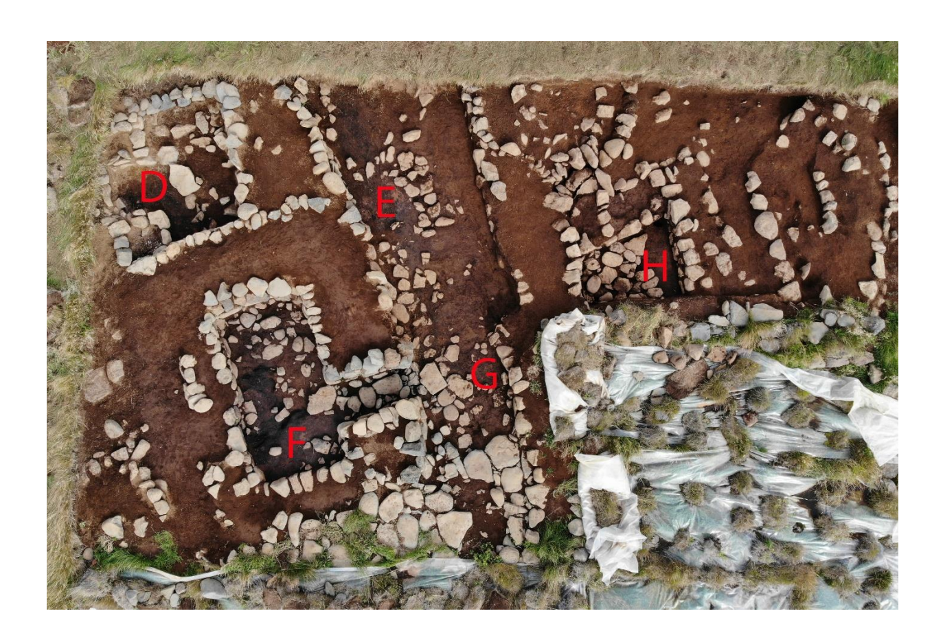
Figure 1. Overview of 2019 excavation area. Rooms are identified with letters. /Yfirlitsmynd af uppgraftarsvæðinu 2019. Rýmin eru einkennd með bókstöfum.

including the removal of a floor levelling layer/foundation ([94451] & [94969]) and under that was found a black, charcoal-rich midden which spread out under the floors and walls of Structure F and continued north into the space under Structure D and west under (unexcavated) external rubble and collapse. A patch of peatash [94865] lay over this charcoal layer and could be part of the same midden but also may be contemporary with Structure F as it seems to infill a possible hearth. The underlying midden will not be investigated further but it does point to earlier activity in this part of the site which may also be associated with a turf wall found in 2018 under Structure D. The main focus of investigation in 2019 otherwise concentrated on the area to the east of Structures D and F, including a linear space separated into a north and south part by a turf wall – designated as Structures E and G respectively. In addition, the area to the east of E and north of A was investigated, resulting in the discovery of another new building, here designated as Structure H (fig. 1).