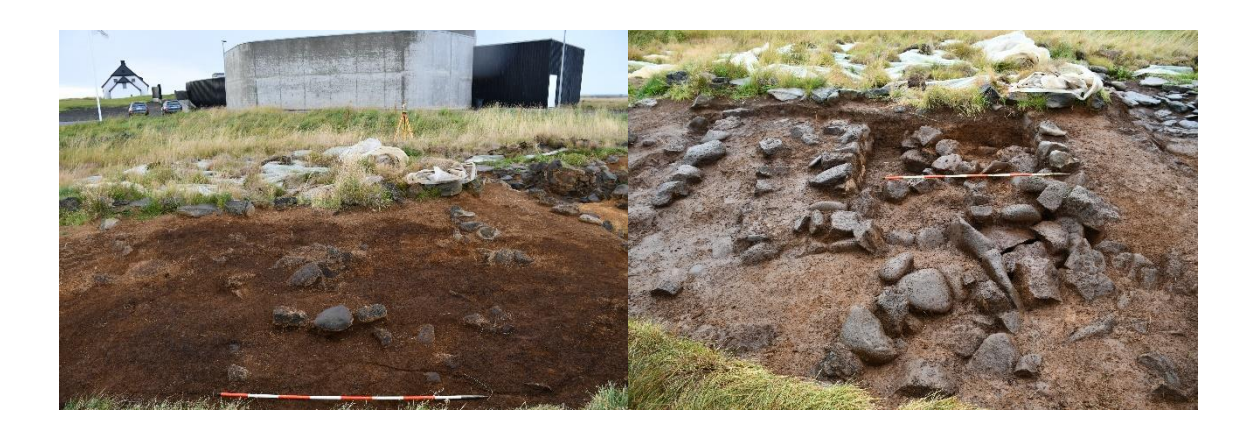
Figure 3. Structure H before (left) and after (right) excavation; facing south / Mannvirki H fyrir uppgröft (vinstri) og eftir (hægri). Horft til suðurs.

This structure was exposed for the first time in 2019, though indications of its presence were evident from soil discolorations and fragmented wall lines. The building lies both north of and under the later Structure A; only the northern section outside of A was investigated in 2019. After removal of some dark soil [93418] and some turf debris ([93904], [93767], [94133]), the outlines of the structure became clearer (fig.3).